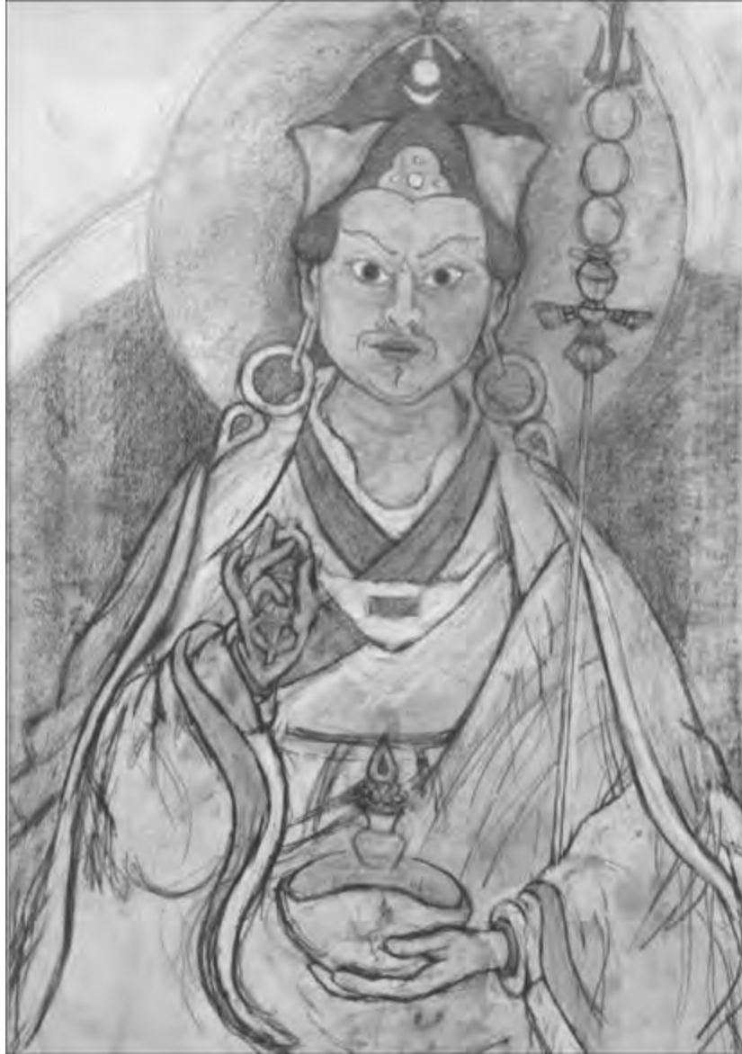
Pencil drawing by Paul Levy, Padmasambhava , 17" × 25½", 1992