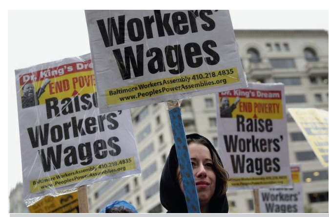
Why $15 an Hour?

For the last 40 years, the value of the minimum wage has declined, and in the last ten years the decline has accelerated. Even worse, since 2008 thousands of good paying jobs that disappeared in the economic melt-down have been replaced by jobs that pay much less, so the overall wage scale has also been driven down signficantly. And, to top it all off, during roughly the same time period we've seen attacks on the right of workers across the country to organize unions and bargain collectively. Unions are the most effective way that workers can protect their wages and working conditions. And it's no coincidence that while all this was going on, corporate profits skyrocketed.