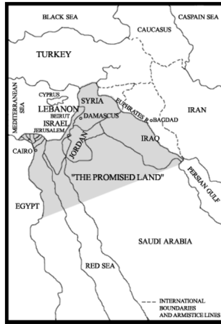
(Map of Herzl's plan for the Jewish State: Eretz Yisrael)