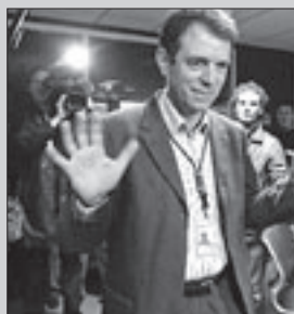
3M executive taken hostage in March

from the Minutes of the Federal Reserve Board April 9th 2009