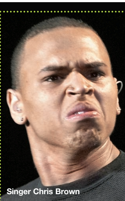
Singer Chris Brown