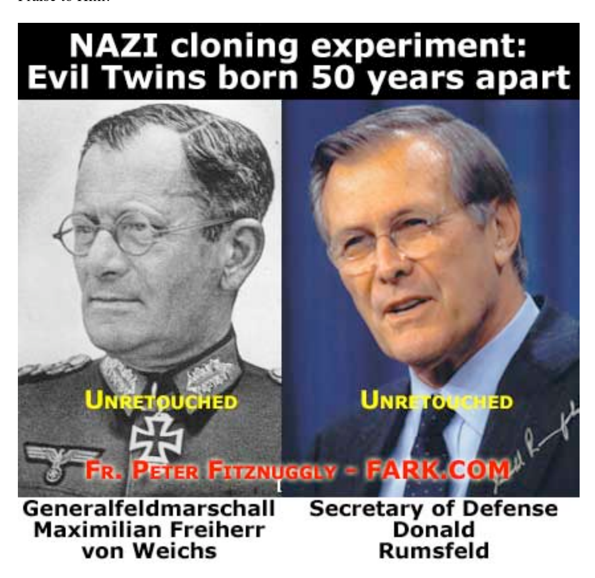
P.S. Here is one more picture I just have to throw in. It seems to be a sign from our Heavenly Creator, and He is a Magnificent King in all regards, even including a twist of humor in our discovery of His Overall Plan. Our immeasurable and Eternal Thanks and Praise to Him!

Disclaimer : This website, 911Exposed.com, publishes a freely viewable and downloadable <u>multi chapter e-book</u> (html and PDF pages computer-virus-free) meant to be shared with all Americans of all ages and eventually all others in the world. This book will likely not help you make one more dime in this corrupt system, but it may help you realize some big truths and it may help guide you through personal salvation. We strive to love, respect, and honor