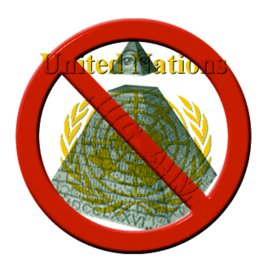
World Government Fascism is now upon ALL OF US This book clearly exposes great deception in world government.