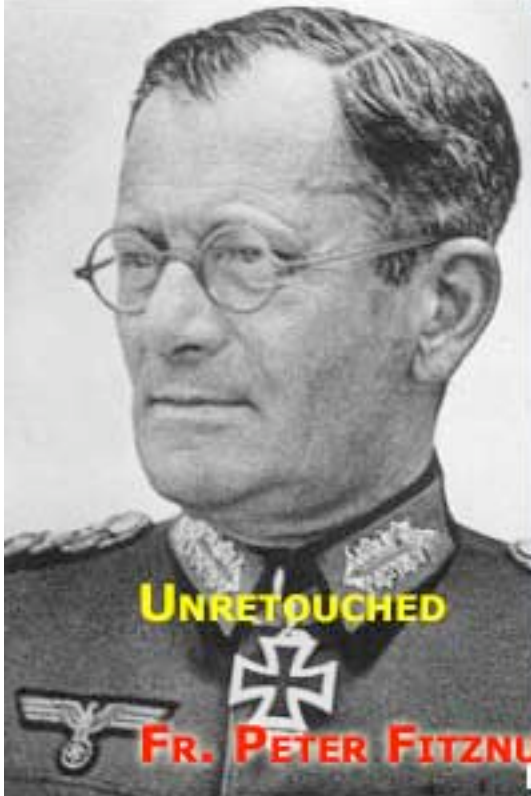
Generalfeldmarschall Maximilian Freiherr von Weichs